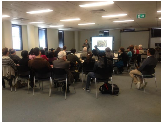
The first session - discussing “Si Doel”

The first session of the discussion series was on a book entitled “Watching Si Doel: Television, Language, and Cultural Identity in Contemporary Indonesia” (Loven, 2008). The book talks about a television series broadcast on Indonesian national television as a means of local ethnic identity actualisation at a national level. The invited discussant was an Indonesian PhD Candidate in Film and Television. His expertise was certainly relevant to the library collection that was used in the discussion.