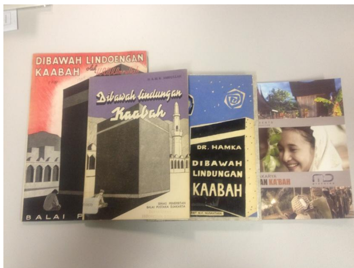
Di Bawah Lindungan Ka'bah – discussion materials

to come and join the discussion session. Meanwhile, having a female Muslim Indonesian educator who has lived more than half of her life in countries where Islam is a minority religion also provided a different “flavour” to the discussion. Through her perspective, the materials showing the contesting romance in Islamic teaching and local culture led through a more lively discussion.