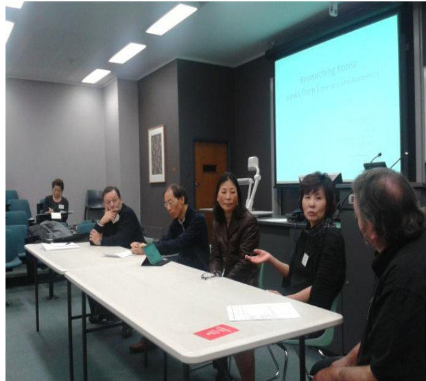
Photo 3. Roundtable discussion panel.