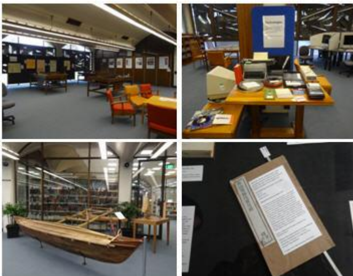
Photo 4. Exhibition for the ANU Library's 50th anniversary.

Other issues raised included cooperation between librarians in Australasia to share resources and building professional relationships with academics and researchers to support and provide adequate information for their academic achievement.